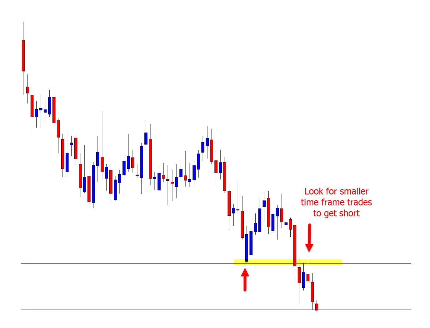
Chart #1: Daily Chart